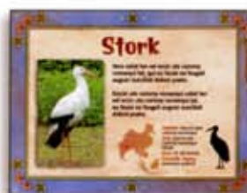
12" x 9" ID Panel