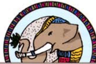
Exhibit materials will reflect the animals' natural habitats (low-tech woods, bamboo, and grasses), and much of the wayfinding signage will be hand-painted in English and Sanskrit and allowed to age. The exhibit will also earn LEED designation.

DENVER ZOO ASIAN TROPICS Interpretive/Exhibit Development