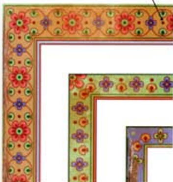
Decorative border treatments reflect the more formal feel of the plaza